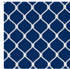
Grille Design 127