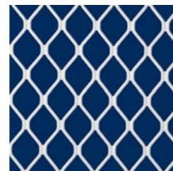
Grille Design 133