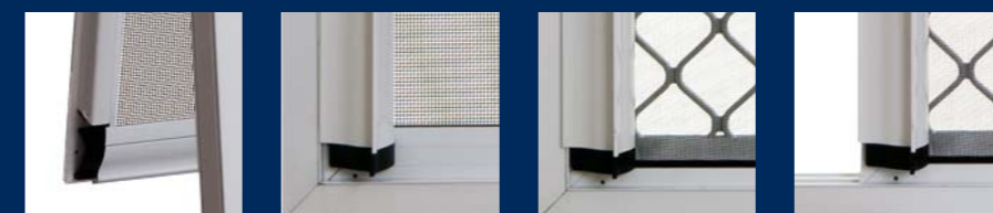
Spring loaded release handle allowing rapid operation in urgent situations