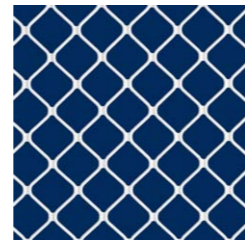
Grille Design 125