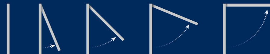
The SupaScape™ fire egress system has an outward opening functionality. Top Hung option shown.

The slim-line keyless design is available in stainless steel mesh and aluminium grille. All SupaScape™ systems are designed to allow you to gain access to the glass for ease of cleaning.