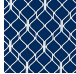
Grille Design 122

SecuraMesh® security grilles are available in a variety of styles and powdercoat colours to suit your home décor requirements.